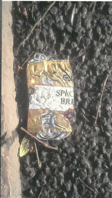
Hartley Road – looking west