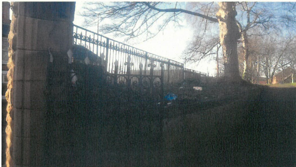
St Peters church, Hartley Road